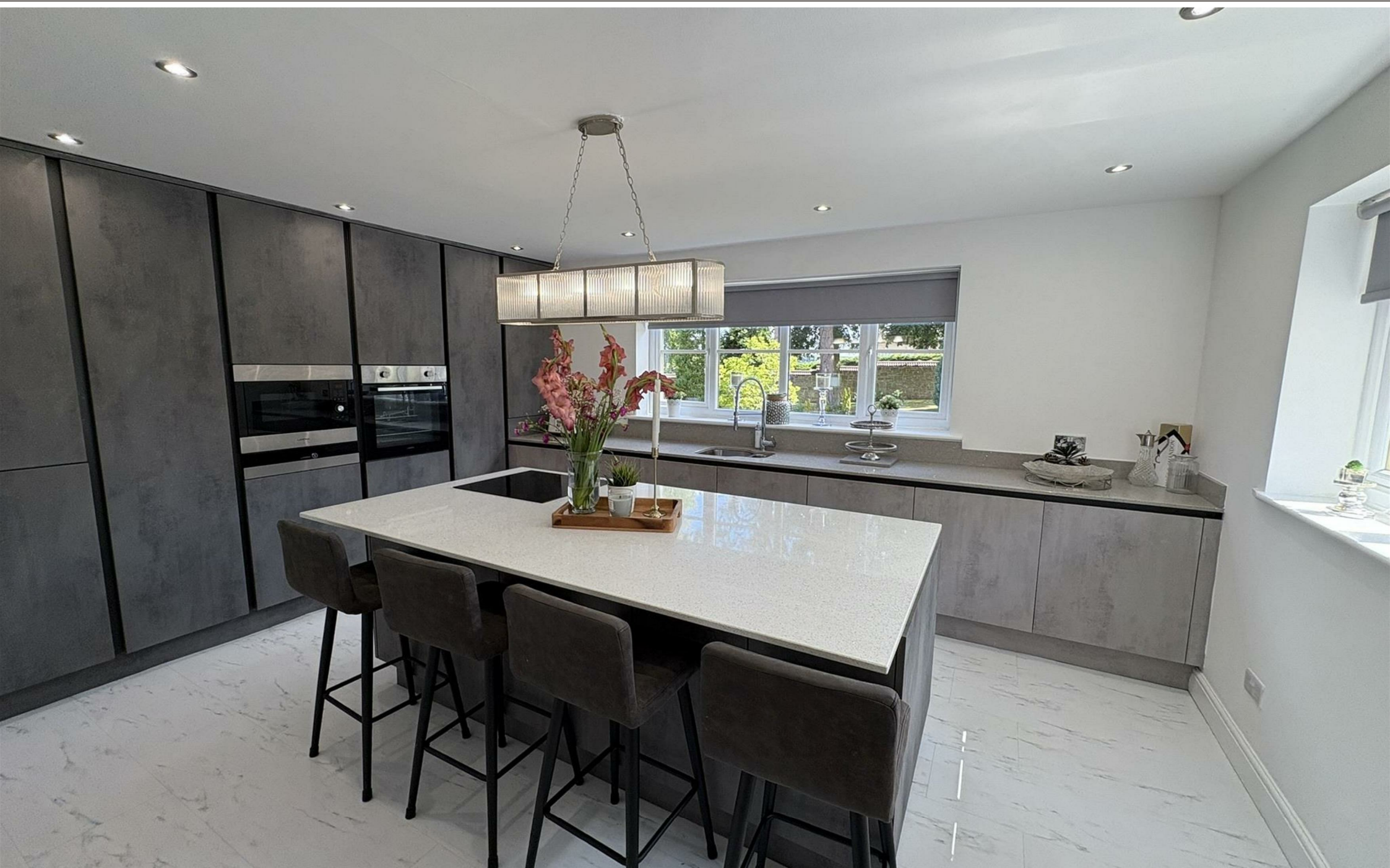
The Copse | Witton Le Wear £575,000